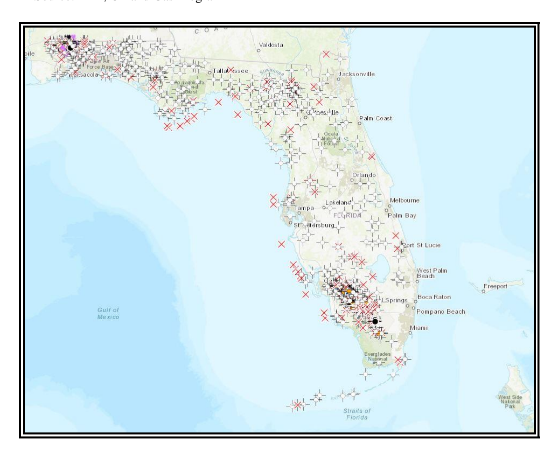
Fig 3: Current Florida Permitted Oil and Gas Wells Source: DEP, Oil and Gas Program<sup>18</sup>